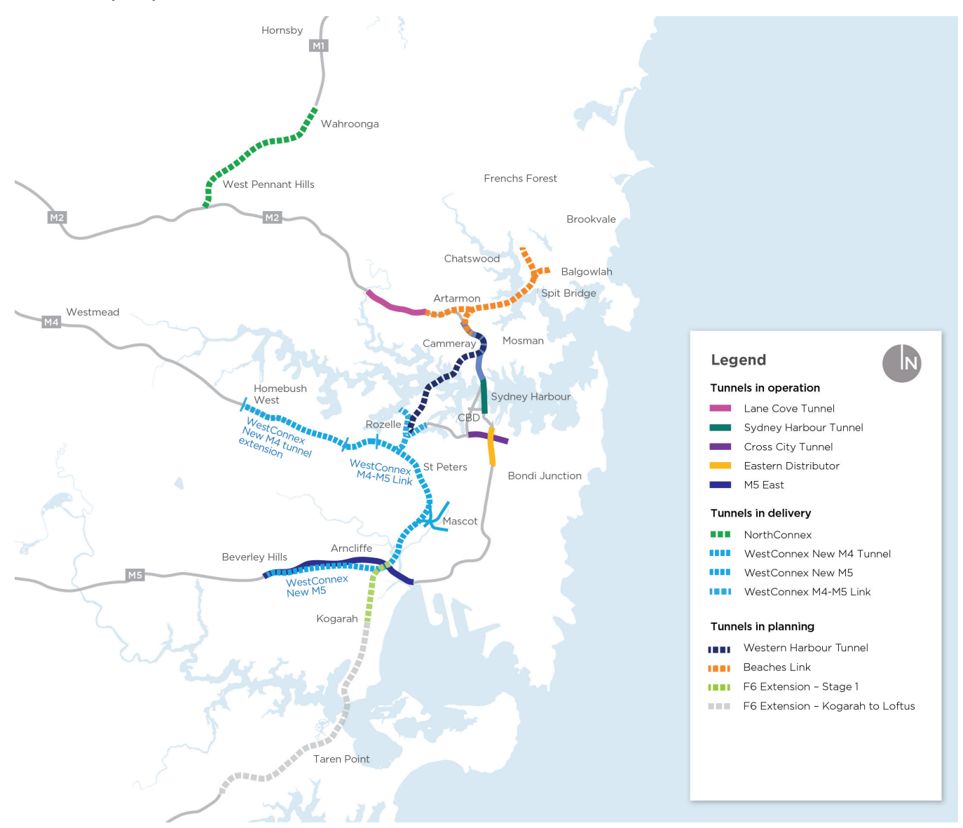
Figure 1: Existing, under-construction and planned tunnels in Sydney

Several new tunnel projects are being considered, or have recently been approved, as part of the Sydney main road network. Figure 1 is a schematic representation of the location of existing, under-construction and planned tunnels in Sydney.